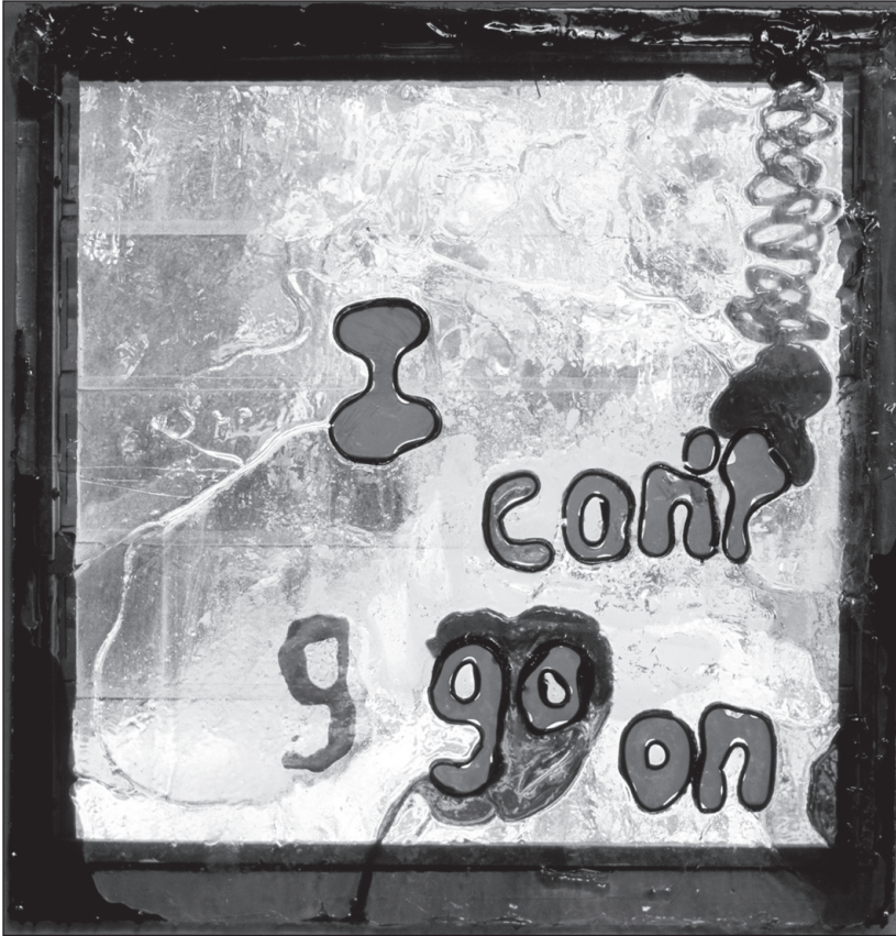
Figure 3: "I can't go on/I go on," sugar, 74cm x 60cm, 2005.