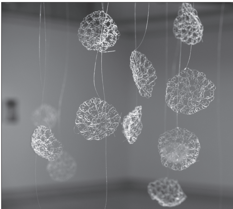
Figure 5a: "Breath in Breath out," detail, nylon thread, 80cm x 60cm, 2006.