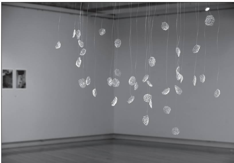
Figure 5: "Breath in Breath out," nylon thread, 80cm x 60cm, 2006.