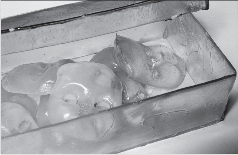
Figure 4: “Melancholia,” sugar, 13cm x 18cm x 11cm, 2005.

in this space of despair that a search begins for the lost object of love, “first in the imagination then in words.” Creative potential is present in the despair over loss. Emotions such as anger, love, anxiety, hostility and sorrow that are experienced by the mother when separating from her adolescent daughter may be transposed into a work of creative imagination.