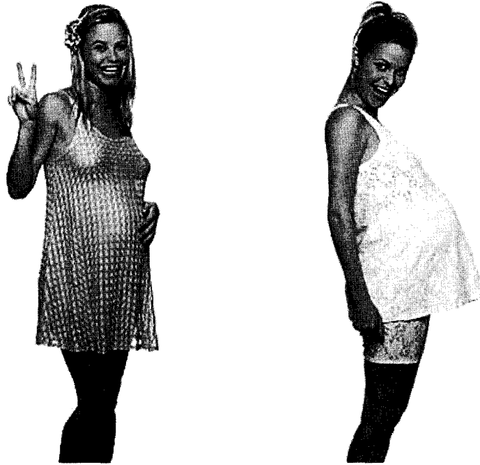
From left to right, LSR Maternity, "Shagadellic," www.lsrmaternity.com www.lsrmaternity.com. LSR Maternity, "Flirty." All layout, garment designs, and content © LSR Maternity 2002.

"flower child," quite literally since she has a flower in her hair. The "Flirty" outfit is only available in white, ironically recalling images of virginity. It is as if the Virgin Mary is remembered—a woman who is pregnant without sexual intercourse. The same model is pictured here also in a very girlish pose.