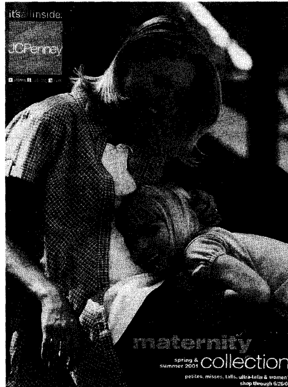
"Front Cover." JC Penney Maternity Collection Catalogue. Spring/Summer 2001

normalizes the ideology that women possess an “innate” maternal instinct to “mother.”