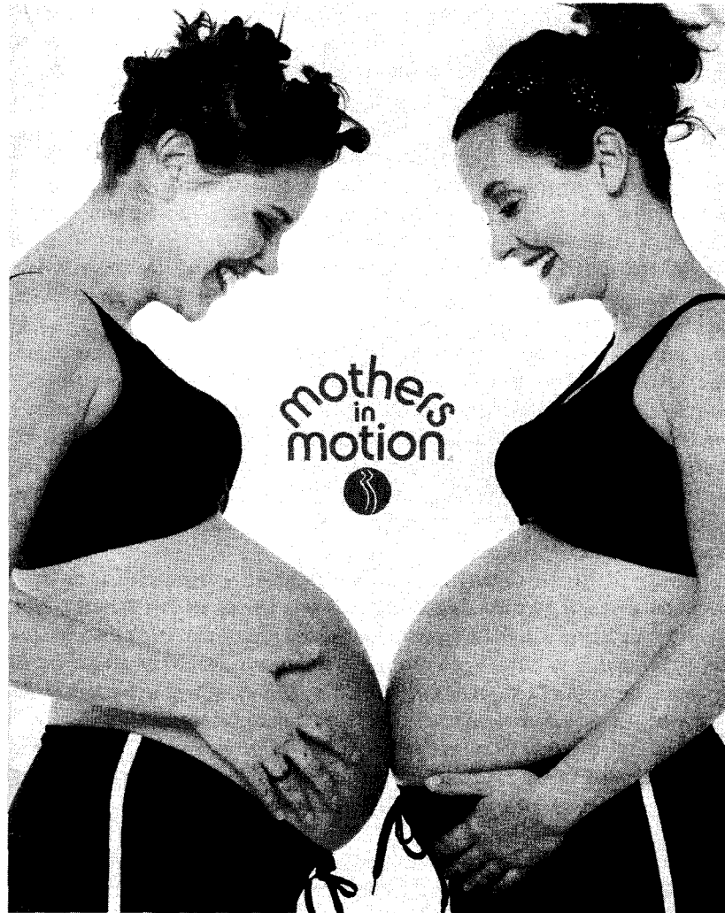
"Front Cover." Mothers in Motion Catalogue 2000.

Despite the essentialist tone of the introduction, Mothers in Motion is both a progressive and regressive company. The catalogue is one of the few that depict the naked pregnant belly. The front cover presents two obviously pregnant women enjoying the sight of their own and each other's distended bodies. However, as with the JC Penney Catalogue , the majority of women are pictured wearing wedding bands signifying heteronormativity.