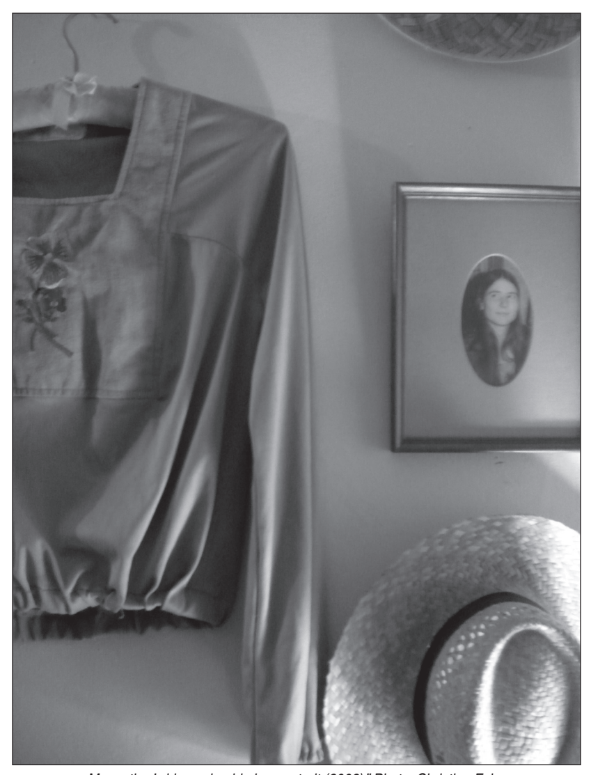
My mother's blouse beside her portrait (2008)."

While my father has been rebuilding our family home with collage aesthetics and architecture, before and ever since my mother's death, as a writer, I have been rebuilding a relation towards my mother through experimental writing: collaging autobiographical fiction, poetry and notebook entries into one text. "Speaking with the dead" is a metaphor, familiar to literary critics, that describes moments in literature that haunt, where the author's voice interrupts our reading of the text, forcing us to think beyond it, and engage in an impossible dialogue (Barthes 121). To overcome this dialogic paradox,