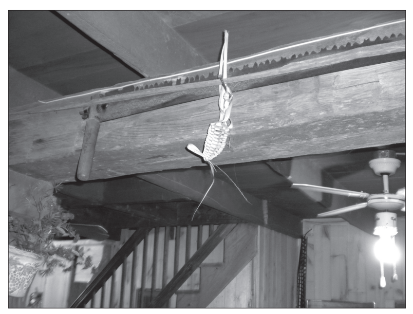
" Sweet grass on saw and beam (2008)."