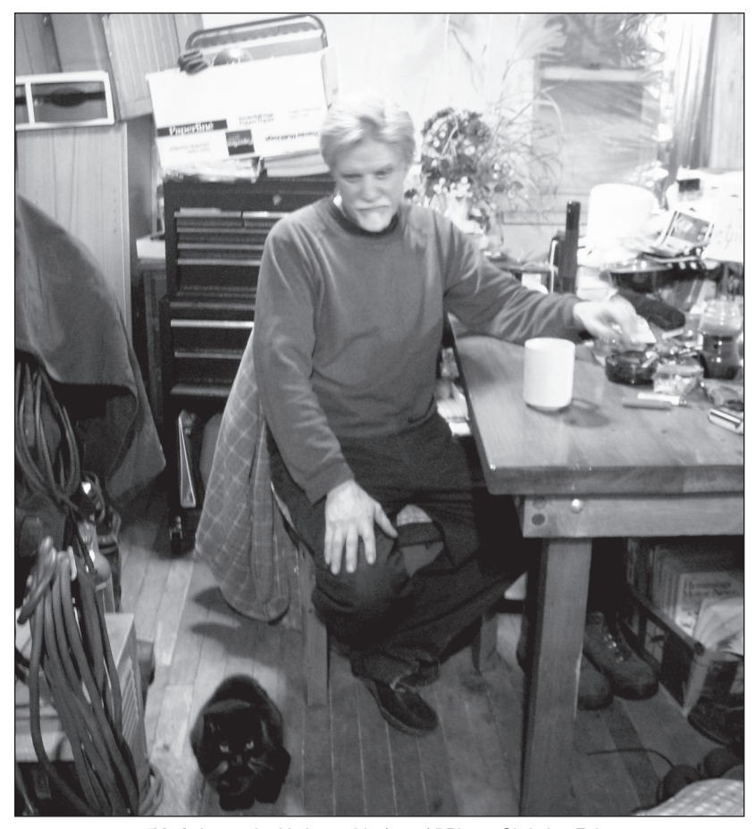
"My father at the kitchen table (2008)."

carried. I argue that mourning through collage allows one to re-member the past towards future ways of reconfiguring loss. Collage disrupts stable categories of knowledge, by finding new coherencies, threading narratives while relying on uncertainty and non-linearity. Storylines are cut-up and retold. Memories are re-membered anew, transformed by being put-back together in a different way. While "collaging" an artist never knows what to expect, images and textures are layered intuitively, as an unconscious process of letting go of a set course. Therefore, by bringing collage to my mother's suicide, I hope to re-member her death from the fragments she left behind, as a way of moving beyond the social stigma and paralysis associated with suicide. What follows is a series of narratives, pulled from my family home, intertwined with theoretical discussions on what it means to attend to an event that shocks, like suicide. And more importantly, regarding my mother's suicide, I seek to explore the ways