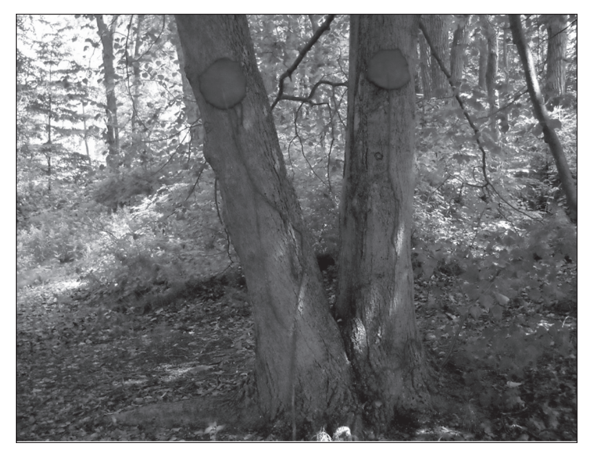
Image 10: Nané Ariadne Jordan, placenta events, Photograph. Toronto Island, Ontario, Canada, 2010. Courtesy of artist.

ecstasy of warm summer days as she installed placenta communities into trees, onto the beaches and into the lake water (image 9 and 10). She floated some, womb-like, on the shores of Lake Ontario, documenting her placenta installations as events of communion with elementals of lake water, rocks, sandy beaches and trees—earthly/birth-ly reminders.