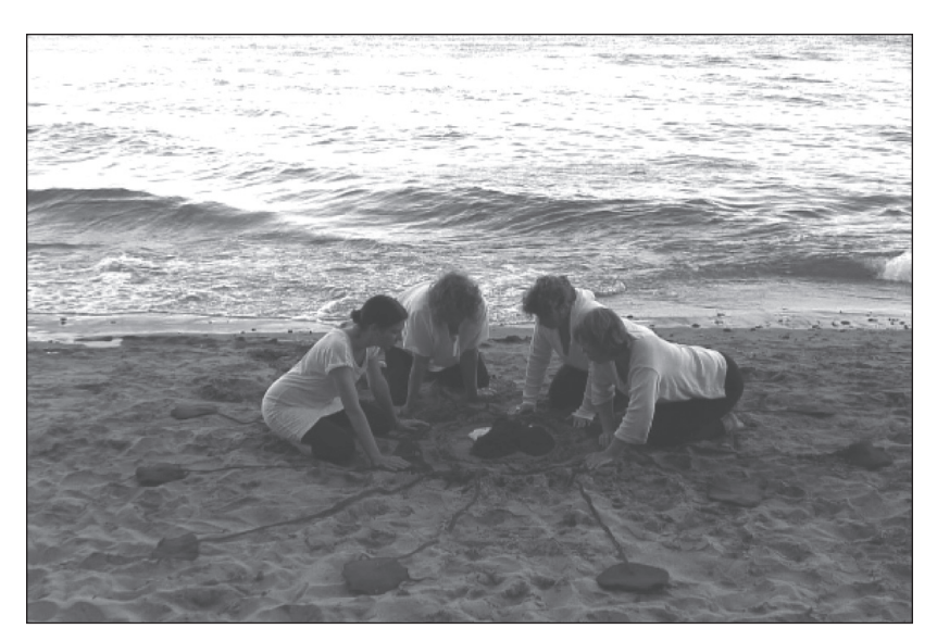
Image 4: Gestare Art Collective, placenta ritual, from video still. Gibraltar Point Beach, Toronto Island, Ontario. Canada, 2010.

blood back to the Earth is a practice of reciprocity inspired by wisdom and indigenous traditions of women's lodges. Individual birth soundings uttered through the experience of re-birth, or self-birth coalesced momentarily with the releasing of the menstrual blood. Through the performance ritual we psychically encountered a re-co-birth and a co-transfusion of matrixial blood within the matrixial sphere.