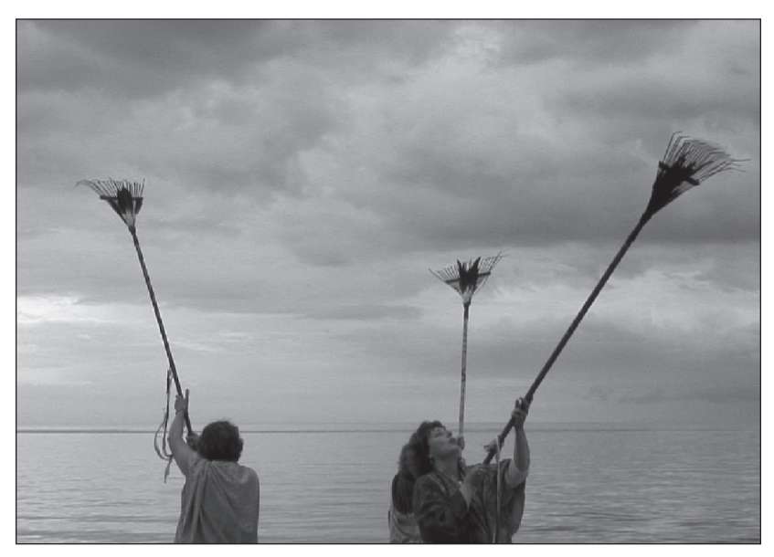
Image 2: Gestare Art Collective, Tracing Absence Sounding Presence, performance ritual video still. Gibraltar Point Beach, Toronto, Ontario, Canada, 2009.

between. The mystery of embodied knowing unfolded during the residency, supported expansion beyond our individual selves to develop the larger mind/Self of being. In this state we understood ourselves to be part of the larger whole of the Kosmos.