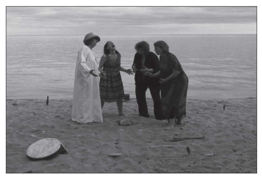
Image 3: Gestare Art Collective, M/Other Ways, performance ritual video still. Gibraltar Point Beach, Toronto, Ontario. Canada, 2010.