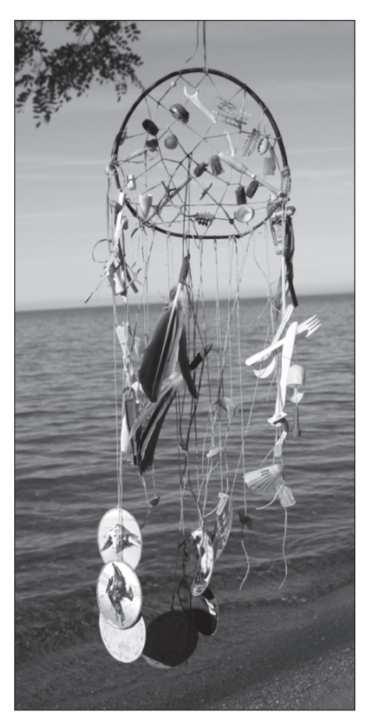
Image 7: Medwyn McConachy, Oil Catcher, found objects, string, photographs, paper, thread. Gibraltar Point Centre for the Arts, Toronto Island, Ontario, 2010.