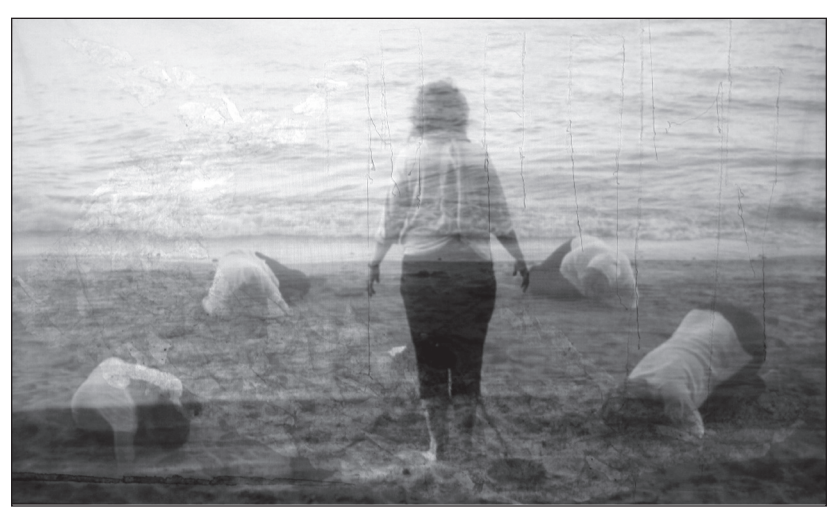
Image 6: Barbara Bickel, Wit(h)nessing Eyes Close(d), video still. Projection onto canvas, paper collage, thread and paint.