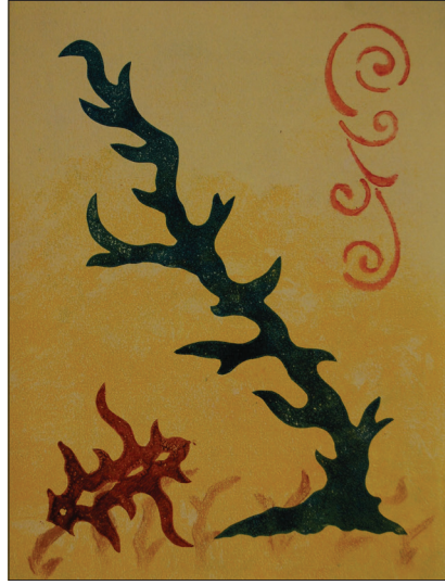
Rachel Epp Buller, left to right, "Silva 1," 2017, monotype print, 18 x 12 inches; "Silva 6," 2017, monotype print, 12 x 9 inches.