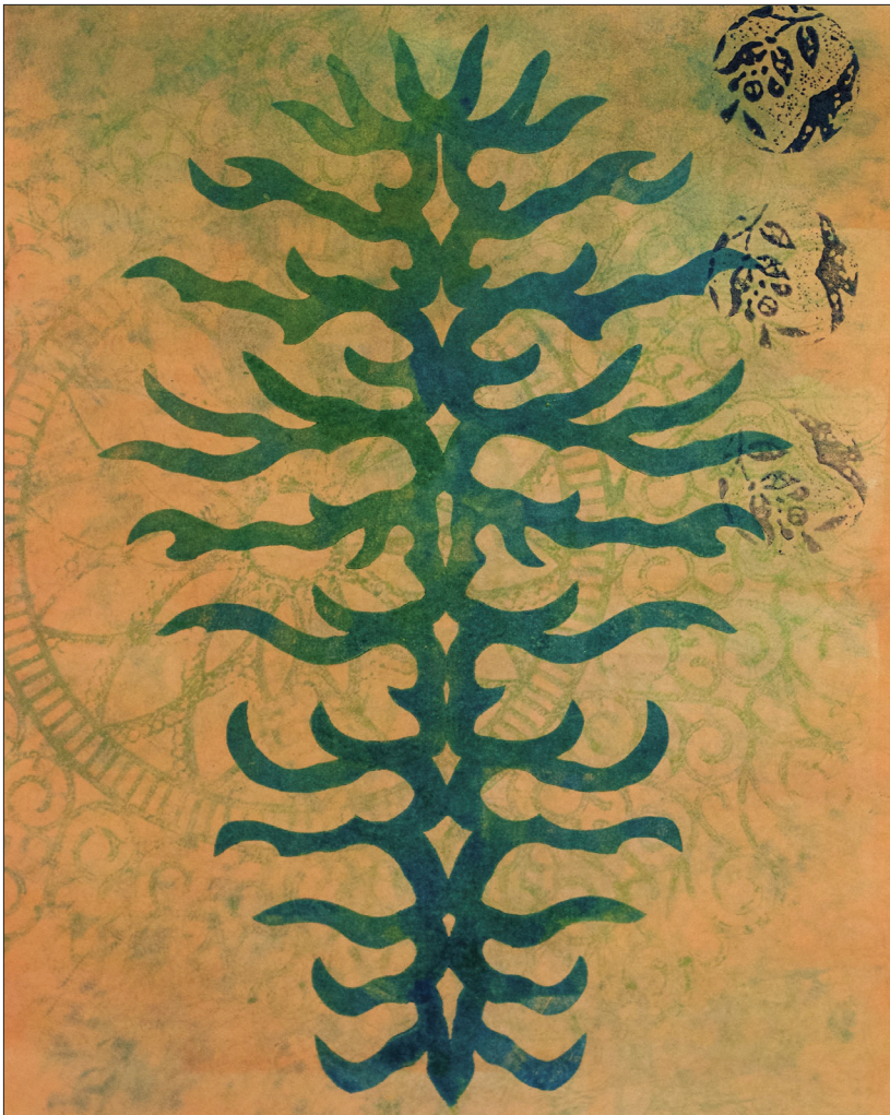
Rachel Epp Buller, "Arbor 24," 2016, monotype print, 12 x 9 inches.