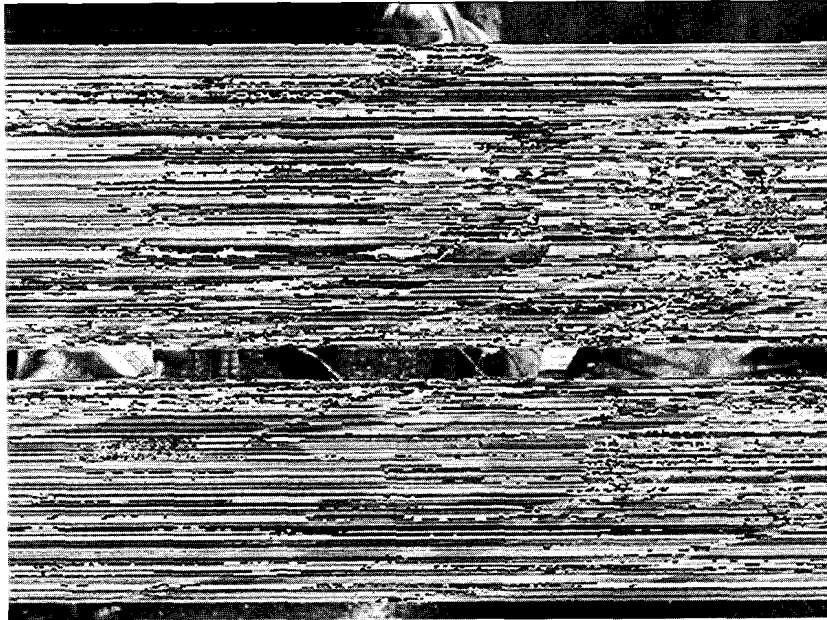
Echoes of Peers

Bold hues of purples, blues, greens, greys, and reds are fighting energy with each other. They are a blur of emotions overriding the moment, muting the events.