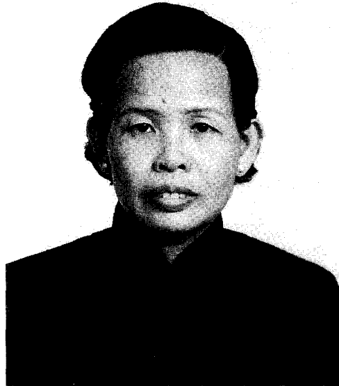
Echoes of an Invisible Motherline

disappointment in her lilting voice. Barely understanding her words, I easily pick up disapproval and judgment in her tone. I have become unaccepted in two cultures.