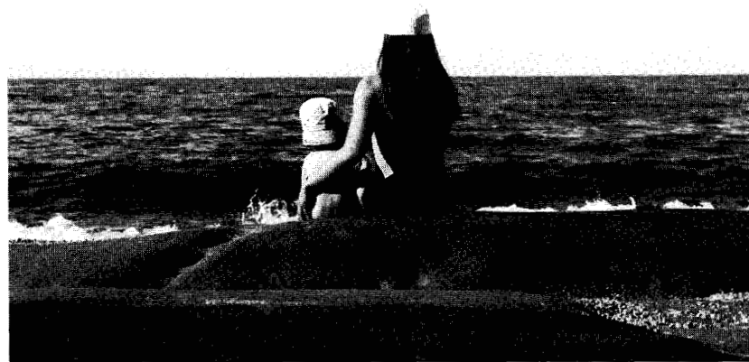
Echoes of Timelessness