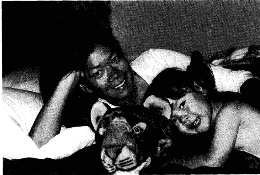
Echoes of a Visible Motherline

fears, challenging us with our life issues, our fallibility, and our humanness. Also in the process, we have the greatest opportunity to witness a new beauty in life and experience a depth of gratitude and joy that stops and stills us. (2001: 139).