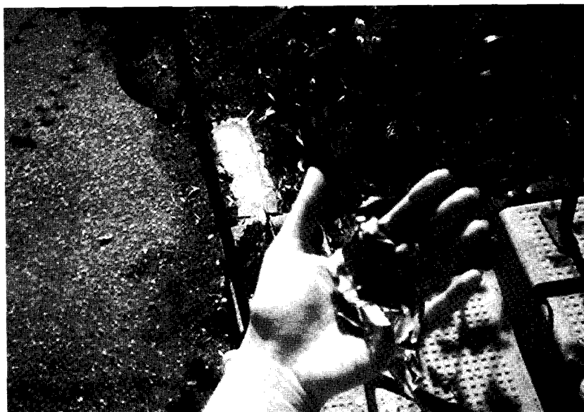
Echoes of Worthlessness

Echoing Wonder ... what of my daughters? Will I mother with intention to their self-worth and dignity?